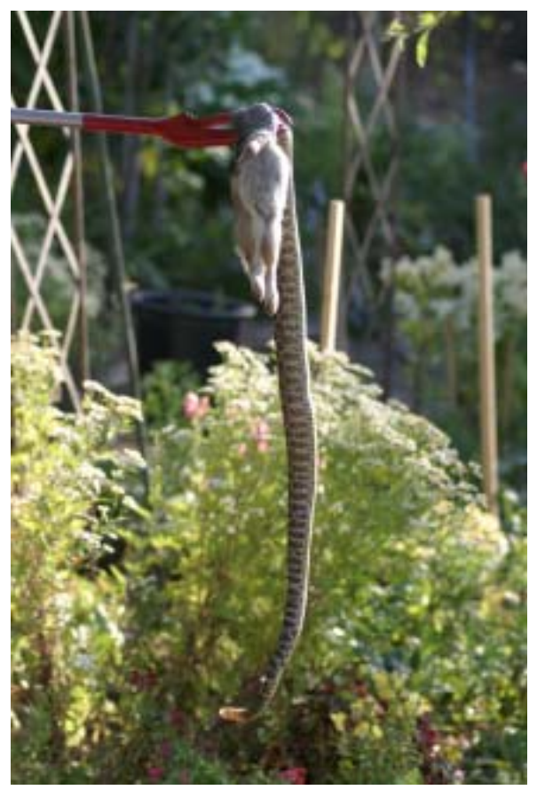
Rattlesnake Interrupted While Dining